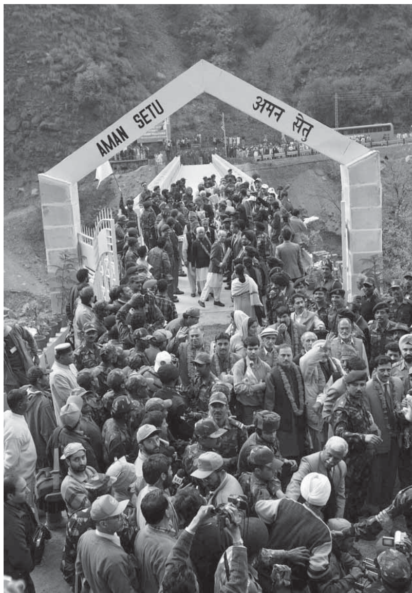
Bus passengers from Pakistan controlled Kashmir, in garlands, cross over the bridge to India, at Kaman Post, near the Line of Control, April 7, 2005.

“You are all the real stakeholders in the future of Kashmir, and it is only through your energetic participation that a New J&K can truly be built. Let this roundtable be remembered as