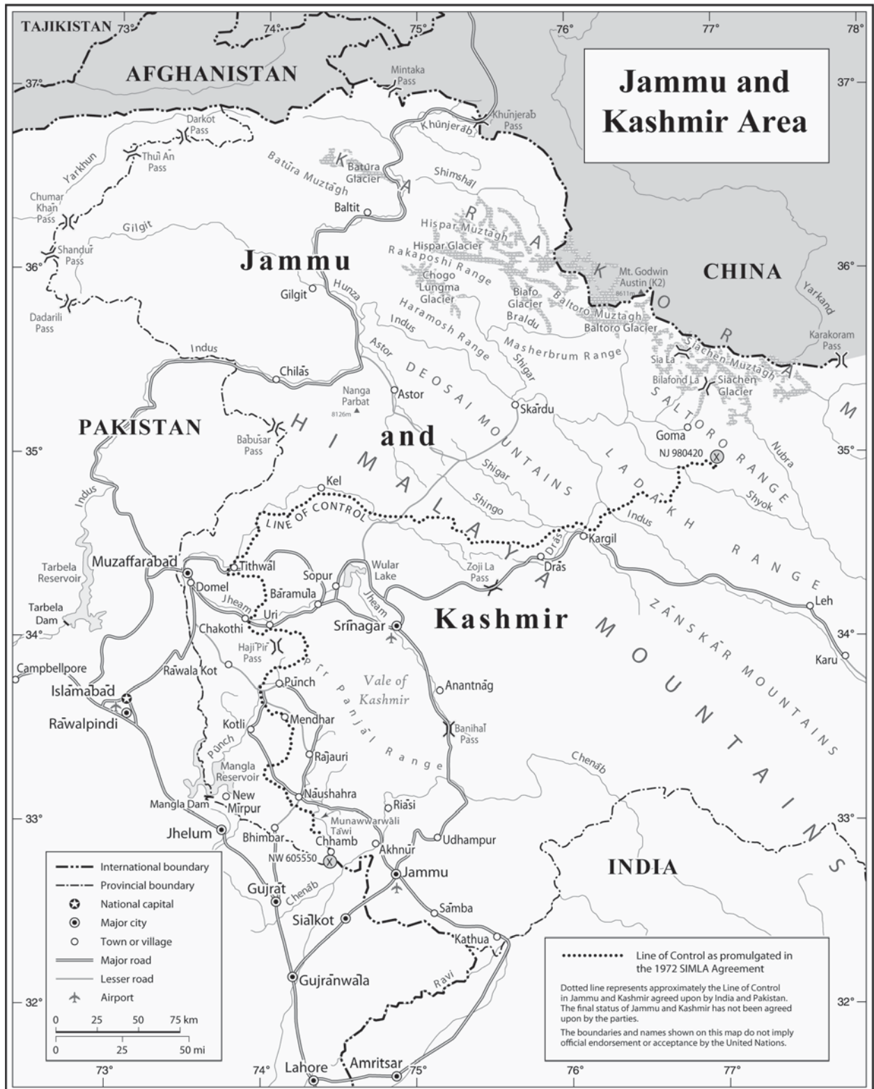
Figure 1: Map of Kashmir