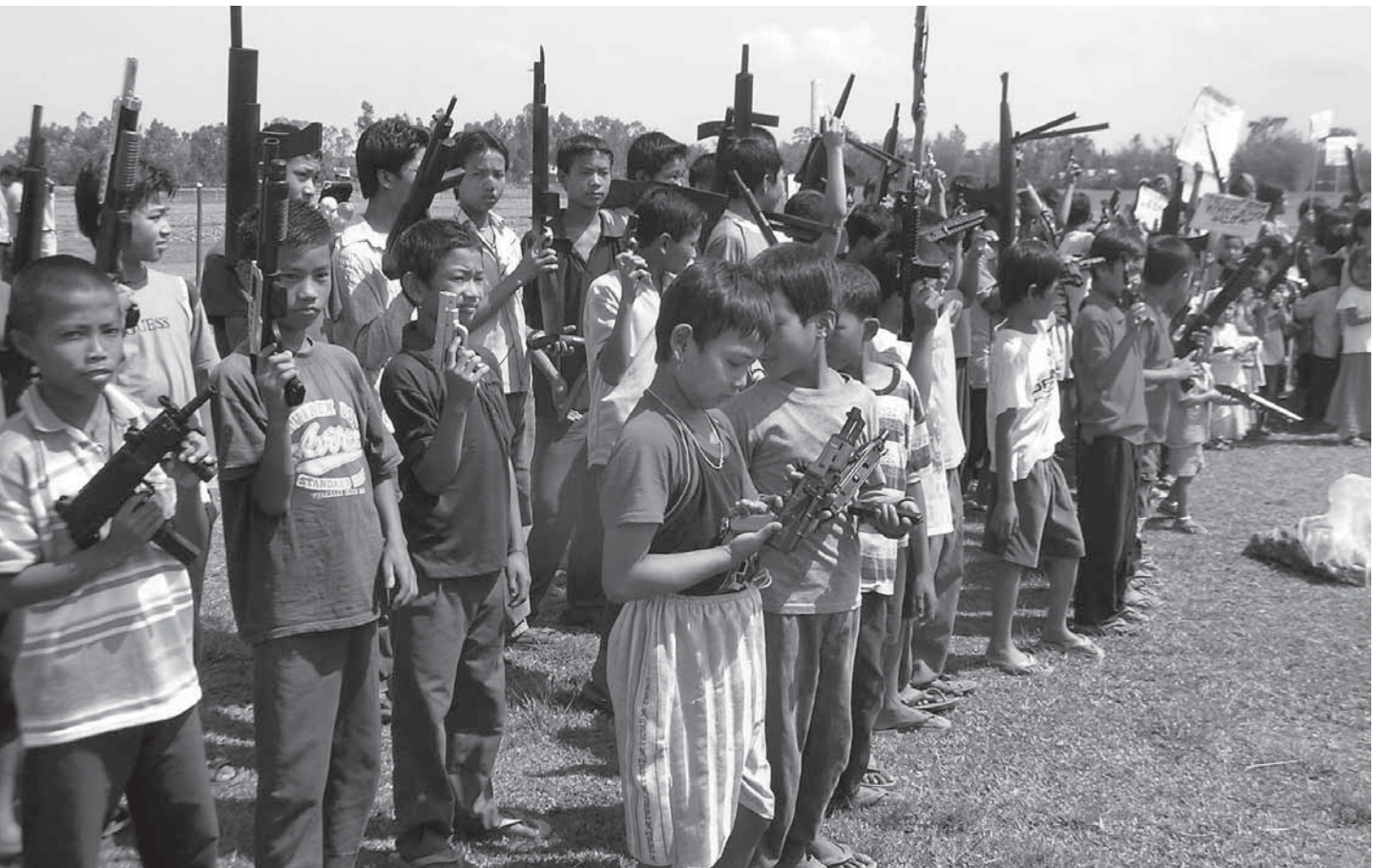
Children hold their toy guns prior to burning them in symbolic protest at Keinou, south of Imphal, May 21, 2008.

lack of commitment by the local political leadership to public welfare, and respect for the rule of law by all entities has diminished alarmingly.